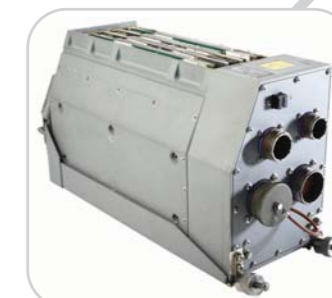
4-slot fixed wing custom installation