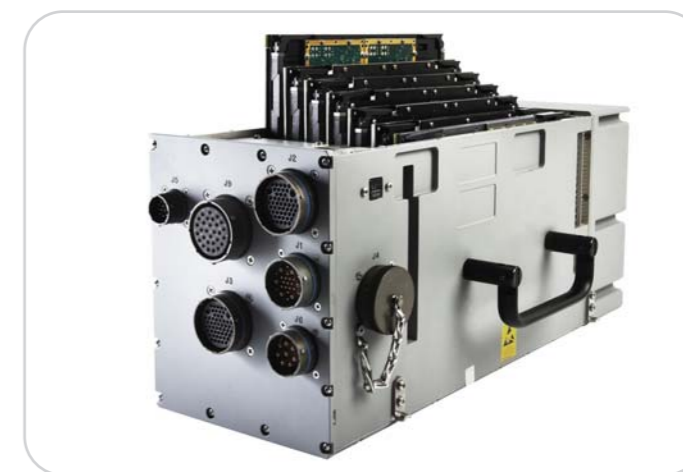
7-slot fixed wing custom installation