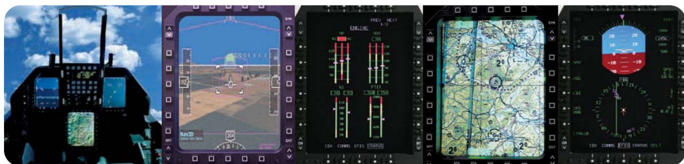
From left: Glass cockpit design • 3D design • Engine performance indication • Colour digital moving map • Electronic Flight Instrument System (EFIS)

True to our maxim of leveraging leading edge technology, ST Aerospace provides you with customised avionics system upgrades for fixed and rotary wing aircraft platforms with our state-of-the-art multi-mission processors.