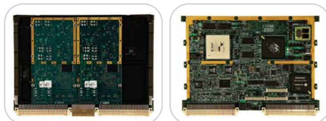
Next generation video graphics board delivers fast processing, powerful graphics and visuals for aircraft platforms

Our multi-mission processors are equipped with next generation CPU/video/graphics boards for fast processing power, powerful graphics engines and high resolution displays.