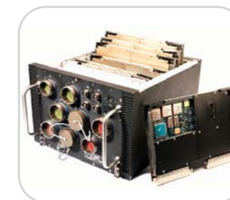
Rotary wing 1 ATR